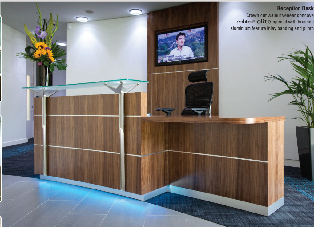
Reception Desk Crown cut walnut veneer concave evolution® elite special with brushed aluminium feature inlay banding and plinth