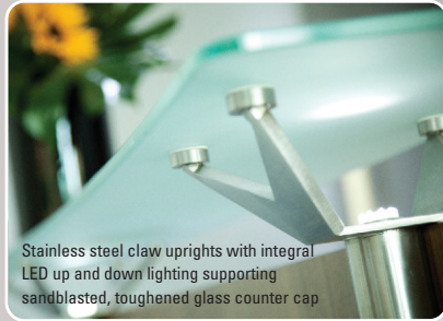
Stainless steel claw uprights with integral LED up and down lighting supporting sandblasted, toughened glass counter cap

Download all images from this case study