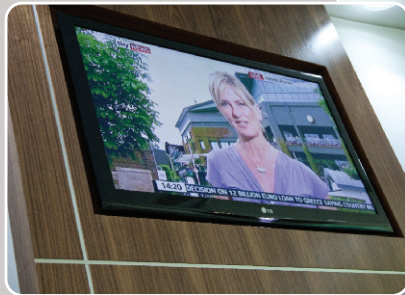
Media Wall & Coffee Table Finished in crown cut walnut veneer with brushed aluminium feature inlay banding and plinth